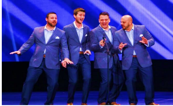
Throwback at Las Vegas International Convention in 2017

Trocadero won the International Collegiate Quartet gold medal in 2015. They will be competing Tuesday evening, the 8 th quartet of the night as #28. Rawsundah will be competing for the first time on the International Stage Tuesday evening, the 14 th quartet that night as quartet #34.