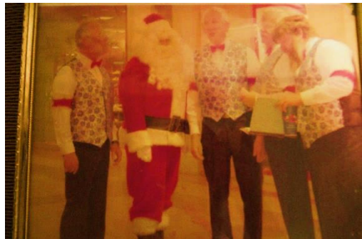
Santa singing with Humbolt Harmonaires at a CA, Mall a ‘few years’ back.

of singing’ (Harmony Brigade Singing, Tag Rooms – even a Youth Tag Room, and AHSOW or Ancient Harmonious Order of Woodshedders, too) along with several shows. AIC Show is Thursday night, Singing with the Champs is Friday night, Choritorium on Saturday night ... but very first , there is a performance of the Swedish Barbershop Chorus MONDAY night at Abravanel Symphony Hall on the North End of the Salt Palace 7-9 pm (check out the details in the story about the Zero8 Concert below) - this IS suppose to be an International Convention.